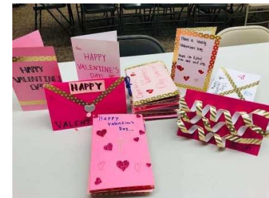
Valentine's Cards MS MYF made!

The middle schoolers enjoy serving and doing for others. The Valentine's project was a great example of our kid's heart for God and others!!