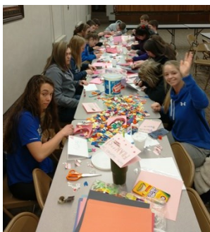
HS MYF making Valentine's Cards.

We also continued our boys' and girls' studies into February, and the studies are going very well! As we look forward into March, we will start preparing for Easter. The high school will be doing the Good Friday service on April 19th!